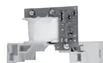
12V & 24V Electronic DC coil