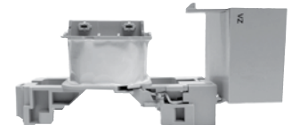
48V, 110V & 220V Electronic DC coil with Back Pack